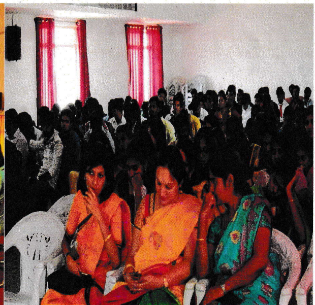
DIGNITARIES AND PARTICIPANTS OF THE PROGRAMME