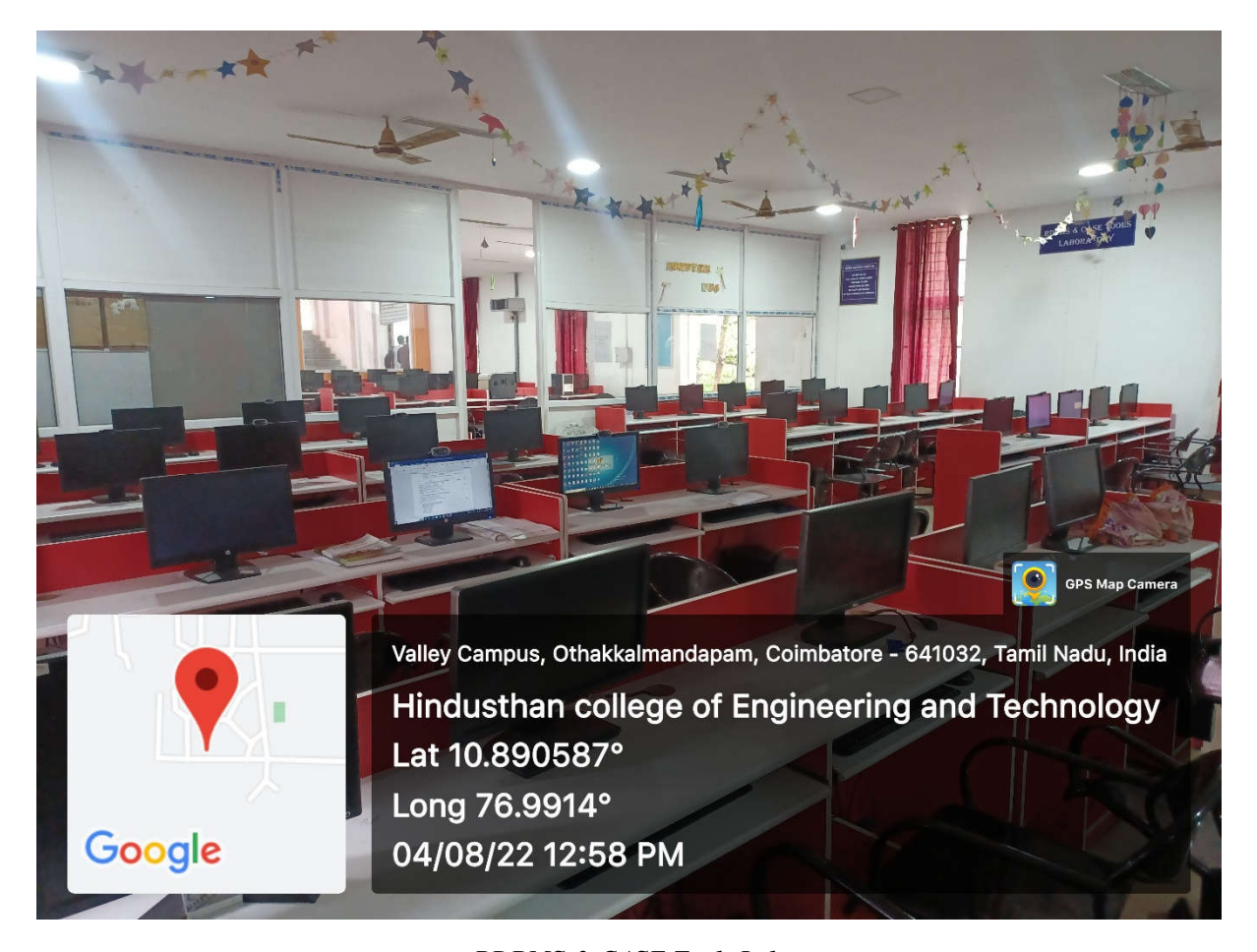
RDBMS & CASE Tools Laboratory