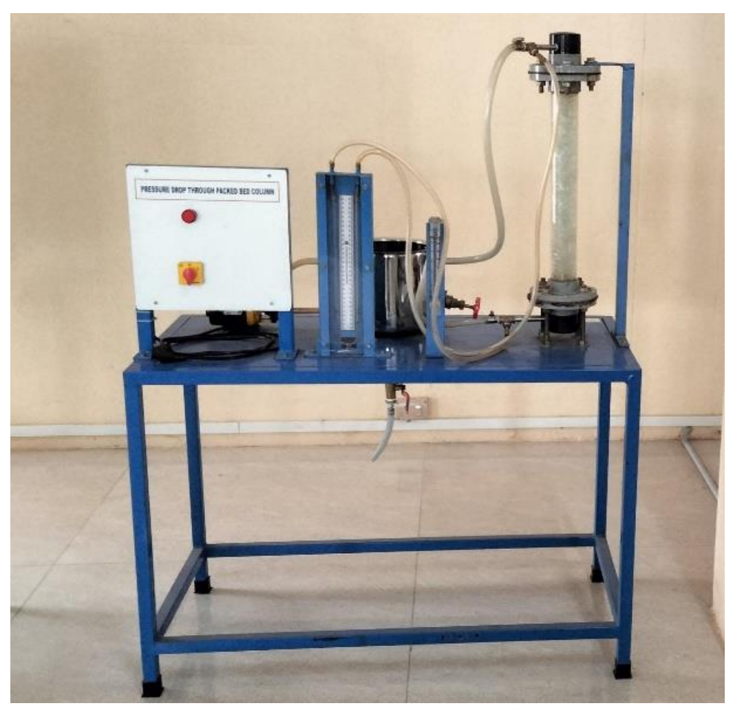
Pressure drop through Packed bed Column