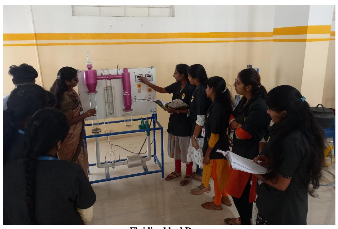
Fluidized bed Dryer