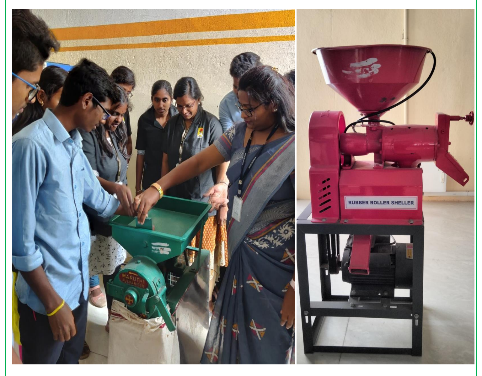
Hammer Mill Ruber Roller Sheller