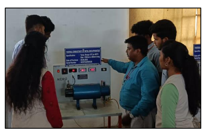
Conductive heat transfer set up