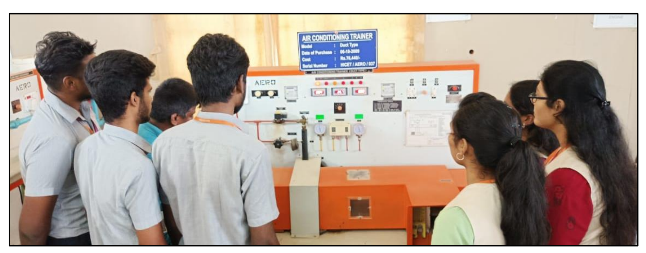
Air conditioning test rig