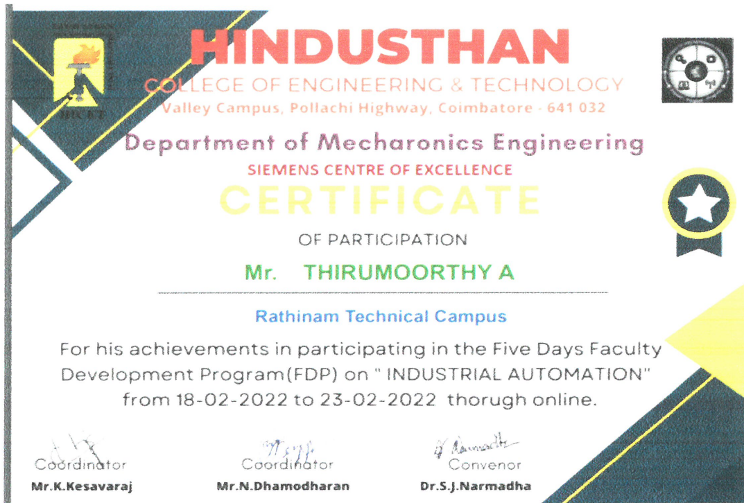
Image of the Event Brochure / Invitation