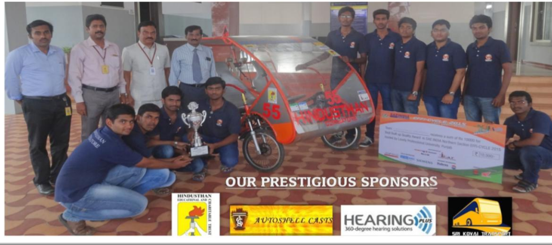
OUR PRESTIGIOUS SPONSORS