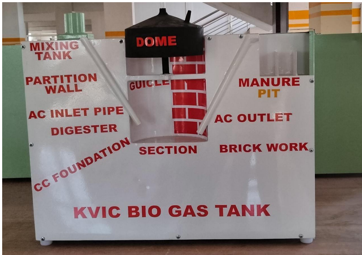
KVIC Biogas plant model