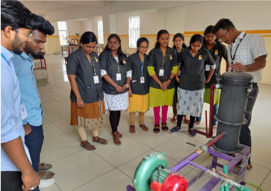
Down draft Gasifier