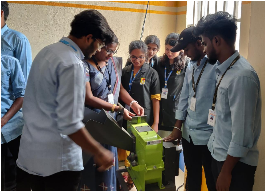
Shredder cum Pulverizer