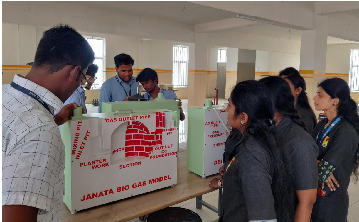
Janata Biogas plant model