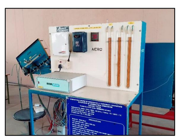
Cascade wind tunnel