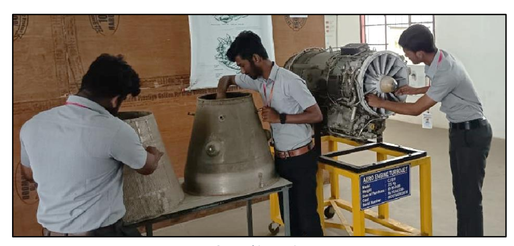
Gas Turbine Engine