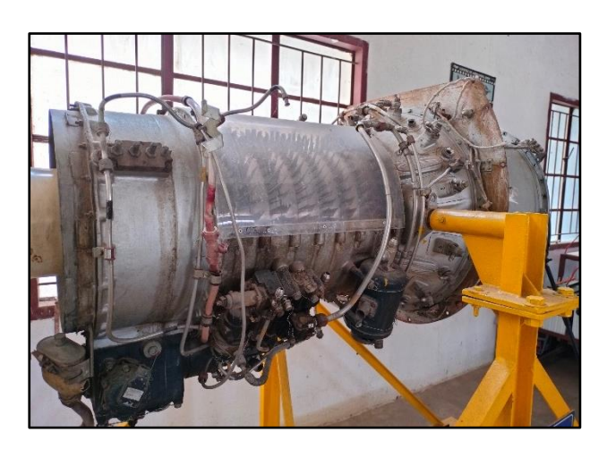
Turbo jet with visible compressor section