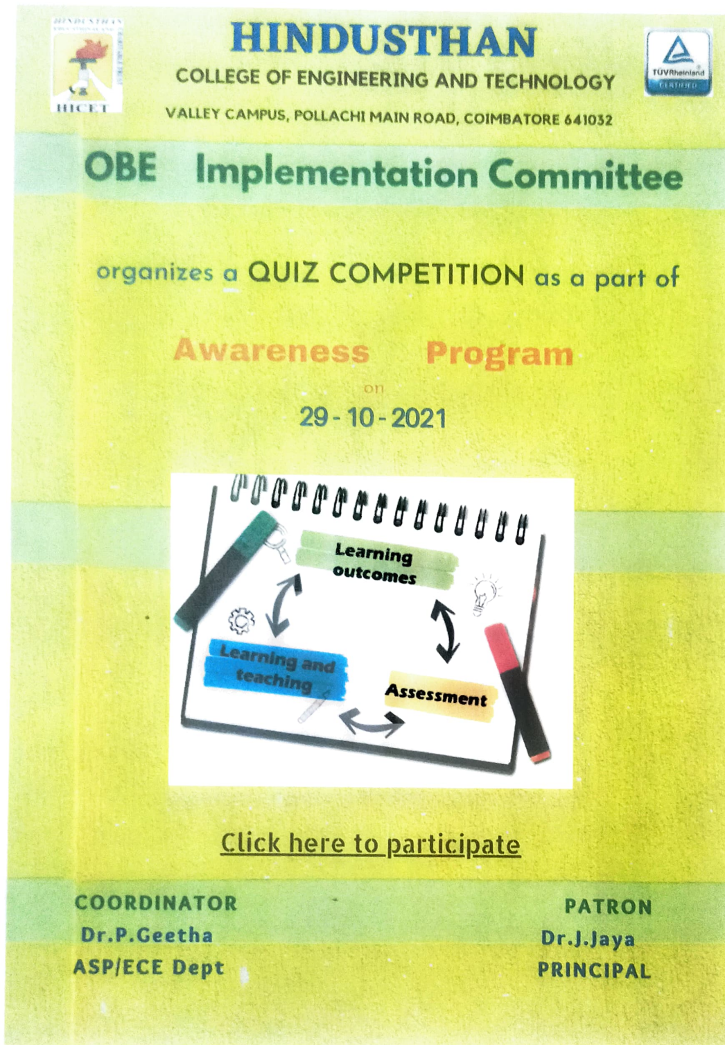
Image of the Event Brochure / Invitation