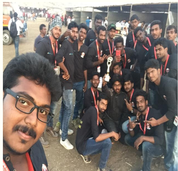
Our team "HINDUSTHANI LAHURIANS" have won first prize in cost report in BAJA SAE INDIA on 21-02-2016.