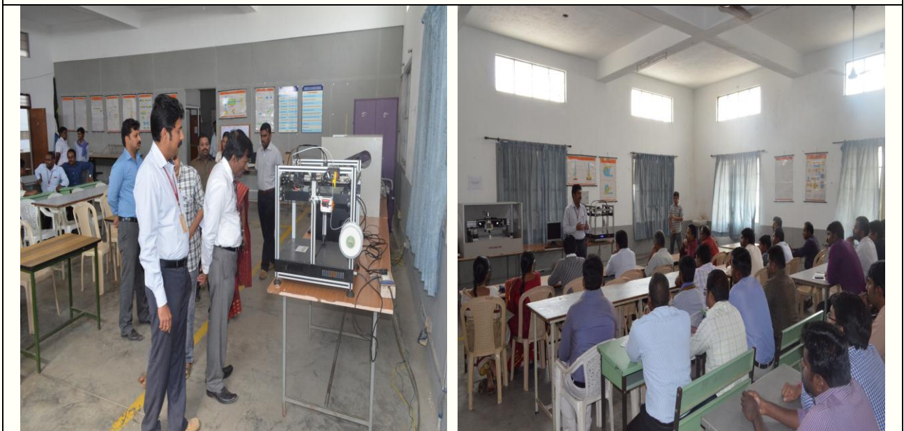
Conducted Two days training on RAPID PROTOTYPING MACHINE (3D-PRINTER) on 28 th and 29 th December 2015