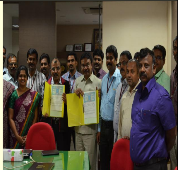
Signing of MOU with the MESSER CUTTING SYSTEMS INDIA PVT LTD on 28-12-2015