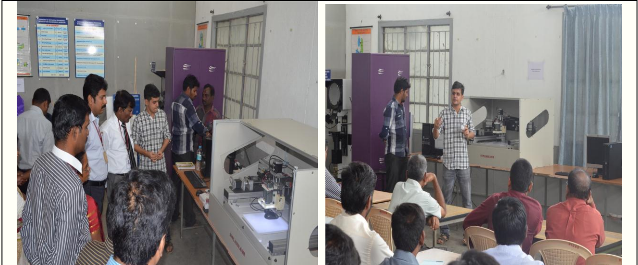
Conducted Two days training on COORDINATE MEASURING MACHINE(CMM) On 28 th and 29 th December 2015