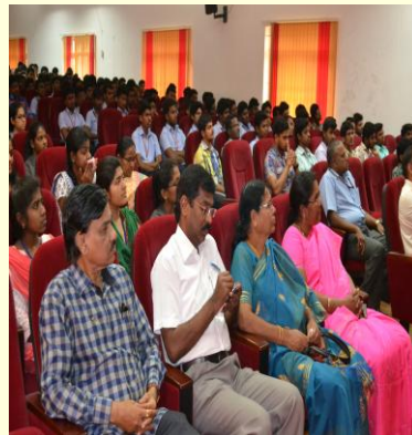
Signing of MOU with the COIMBATORE PRODUCTIVITY COUNCIL and INAUGURATION OF STUDENT PRODUCTIVITY FORUM(SPF) on 08-2-2016