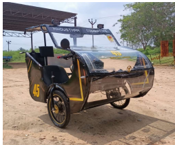
Efficycle 9.1 - 2023