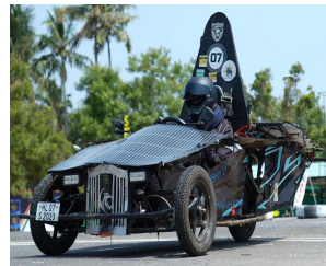
SEVC Solar 2023