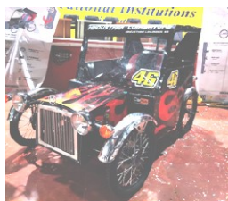
Efficycle 9.3 - 2023