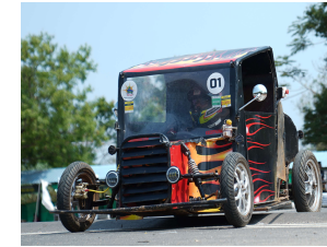
SEVC HEV 2023