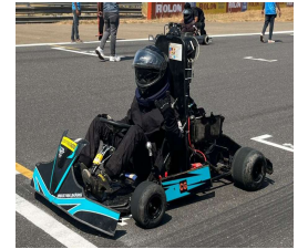
Aims- Ekart 2024