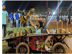
SEVC Solar 2024