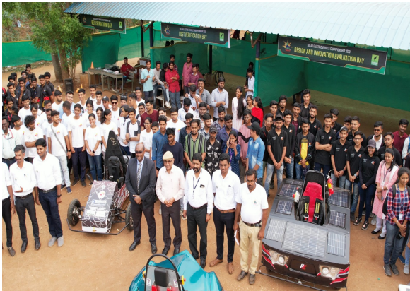
SEVC- SOLAR 2022