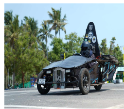
NVSC Solar 2023