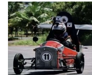
SEVC BEV 2022