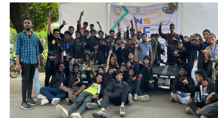
SEVC- SOLAR 2023