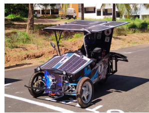
SEVC Solar 2022