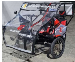
Efficycle 9.2 - 2023