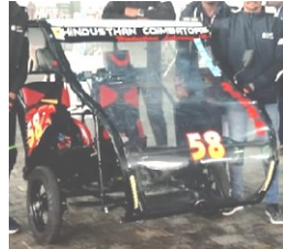
Efficycle 10.1 - 2024