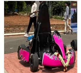
Aims- Ekart 2023