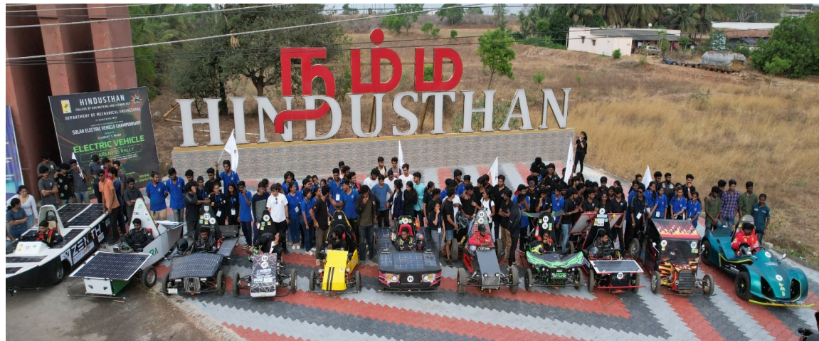
SEVC- HEV 2023