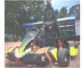
Aims- Ekart 2023