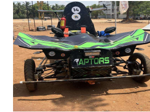
SEVC BEV 2023