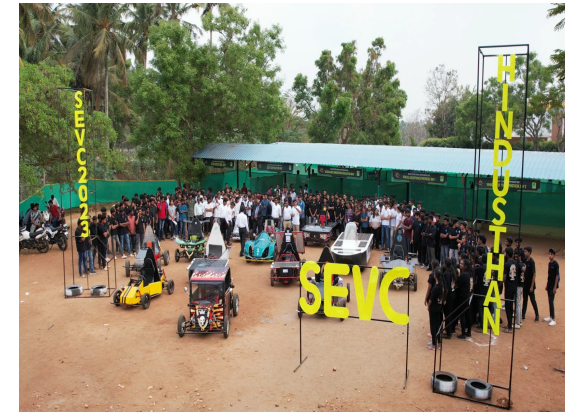
SEVC- BEV 2023