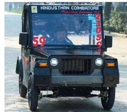
Efficycle 10.2 - 2024