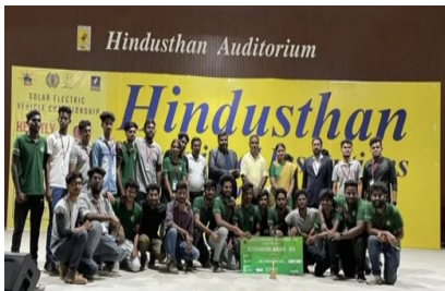
SEVC- BEV 2022