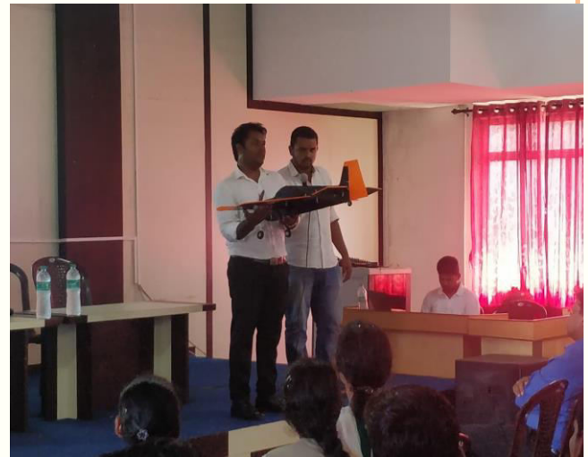
One day Workshop on “Aero Modelling” at PG Seminar Hall, HICET