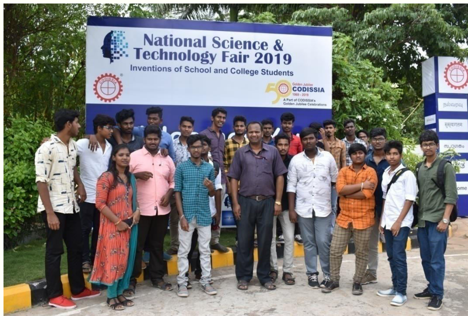
One day visit to “National science and Technology fair” on 31/8/2019.