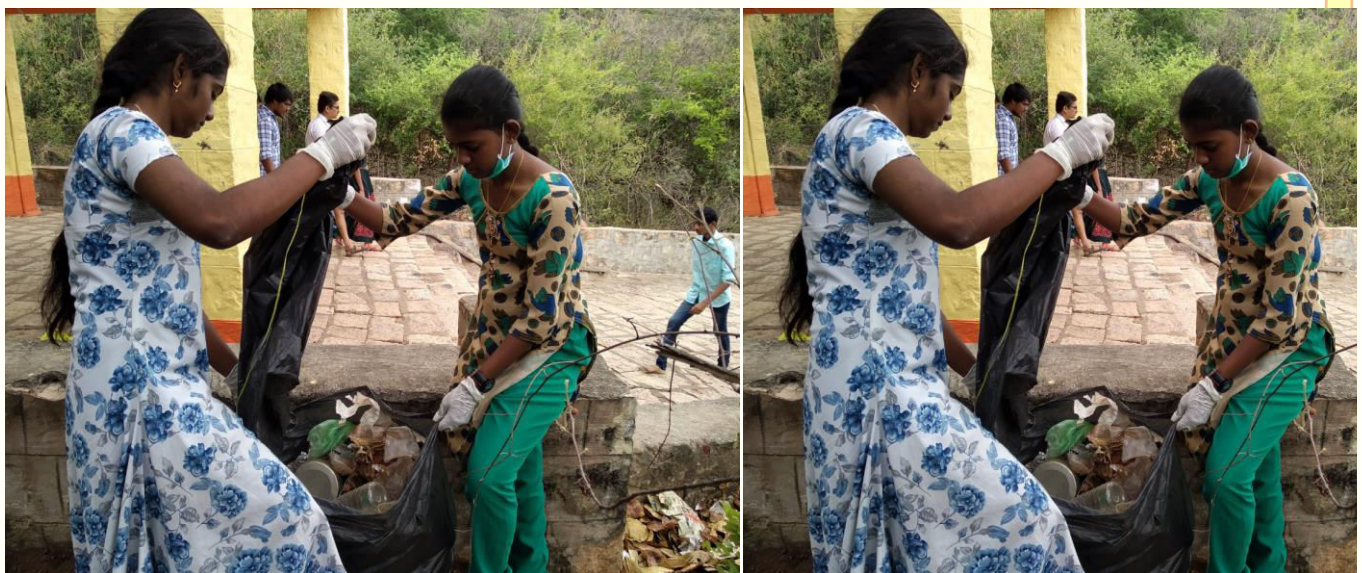
As a part of MCT department social club activities, Students of Mechatronics Engg Department participated in Plastic Cleaning Campaign at Marudhamalai, Coimbatore on 04/08/2019 (Sunday).