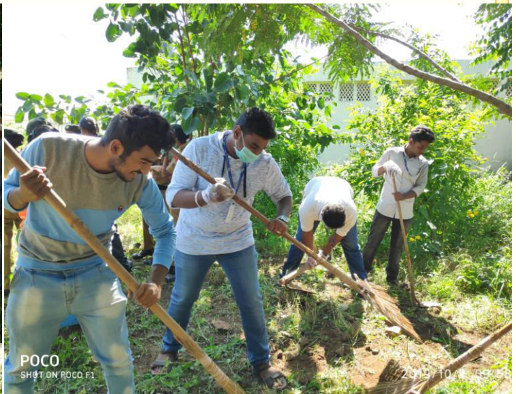
As a part of MCT department social club activities, Students and Faculties of Mechatronics Engg.Department participated in SWACHHTA PAKHWARA – Cleaning and Tree Planting Event (Swachh Bharat Mission) coordinated by NEST – Home For Green Friends Organization at Pothanur Railway Station, Coimbatore on 02/10/2019 (Wednesday).