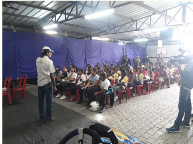
Team Trail Blazer (1 st ALL WOMENS TEAM IN SOUTH INDIA), Students of Mechatronics Sponsored by JK Tyres for participated in the event of GIRLS ON TRACK held at Bangalore on 7 th & 8 th September