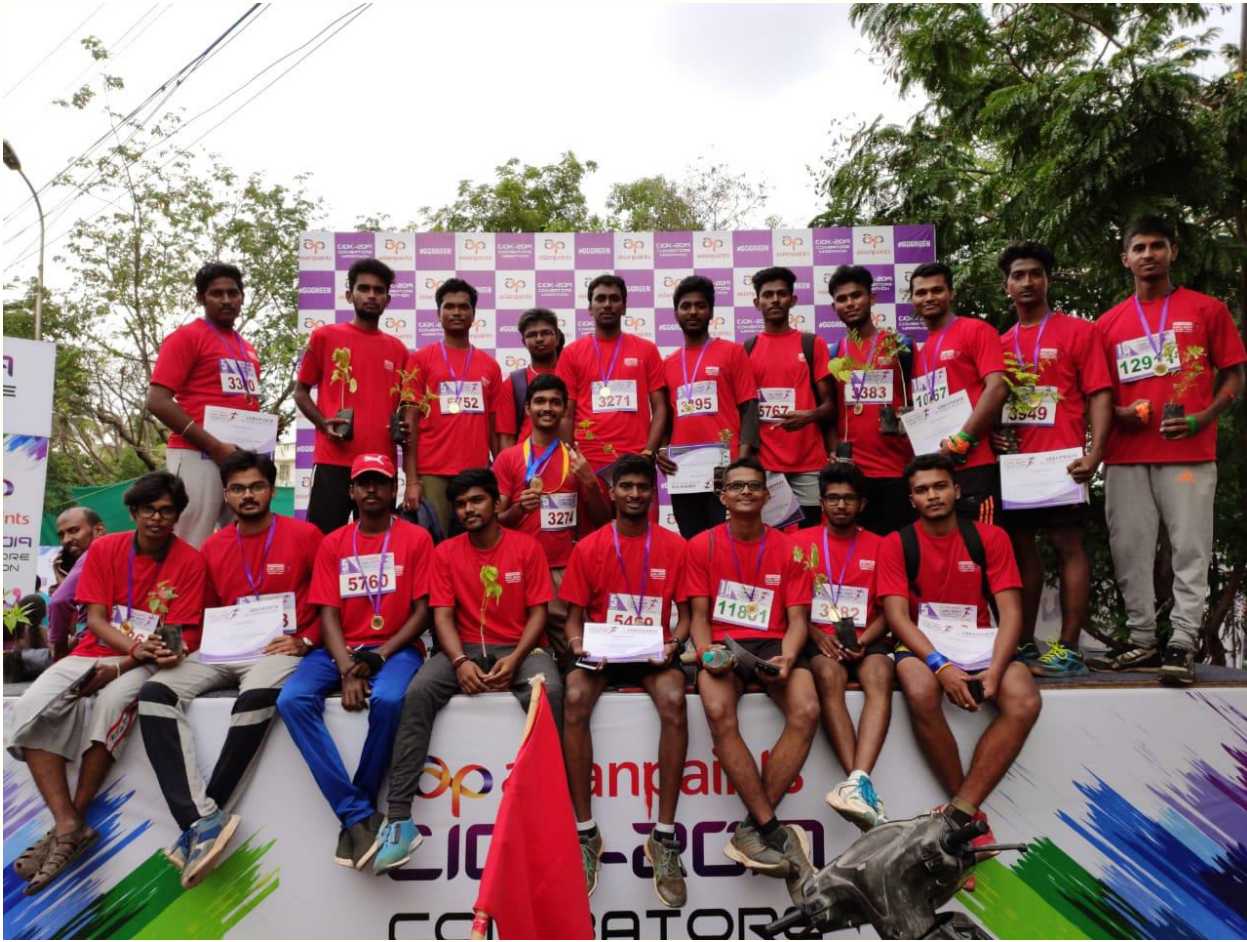
As a part of MCT Department Social Club activities, Students and Faculties of Mechatronics Engg Department participated in C10K COIMBATORE MARATHON conducted by Asian Paints for the cause of Green Society on 23/06/2019 (Sunday)