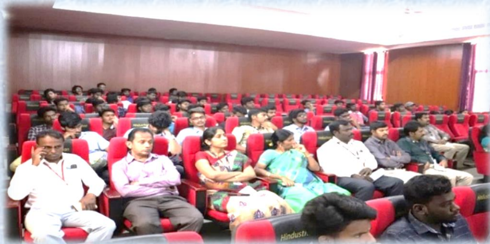
National Level Seminar on “Machine Learning Applications to Clinical Decision Support in Neurosurgery: an Artificial Intelligence” was conducted on 17 th & 18 th February 2020