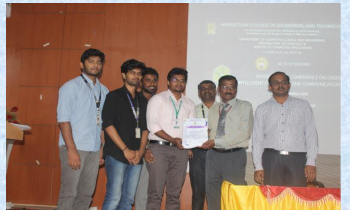
AICTE Sponsored Two days Fourth International Conference on "Green, Intelligent Computing & Communication Systems" was conducted on 5 th & 6 th March 2020