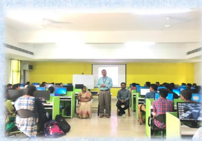
One day workshop on “Data Mining Tool” was conducted on 17 th August 2019