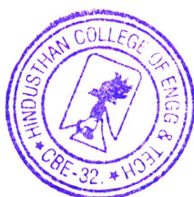
PRINCIPAL Hindusthan College of Engineering & Technology COIMBATORE - 641 032