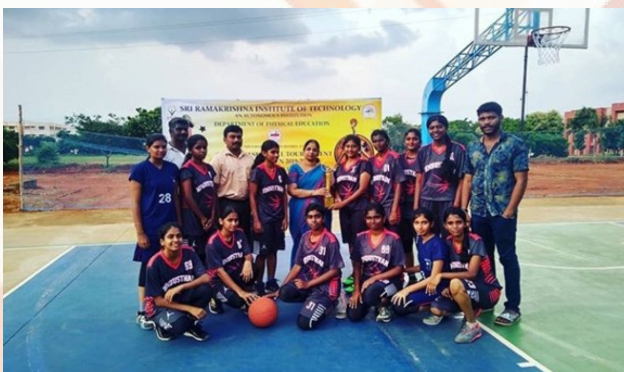
RVS Covai Ties 2020 Basketball