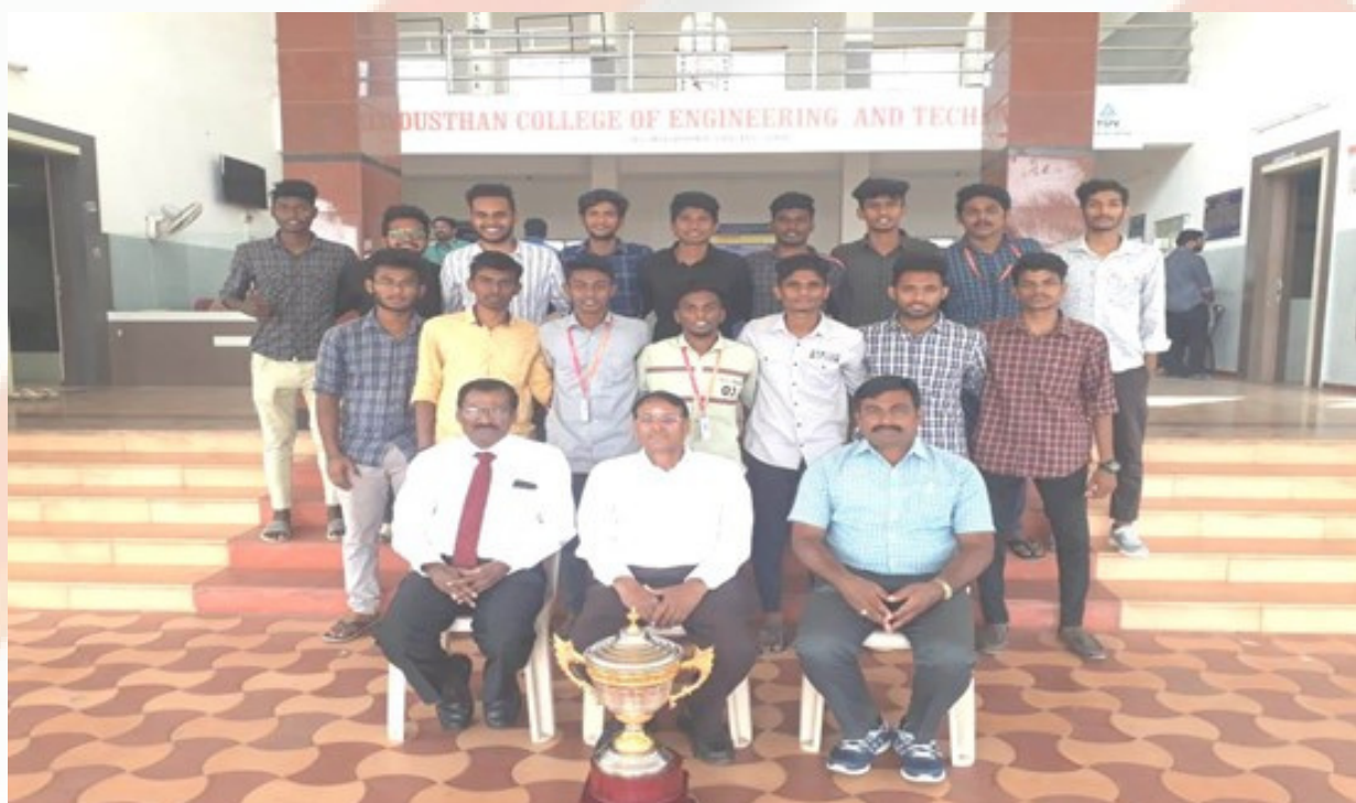
11th Centies Championship 2020 "Football"