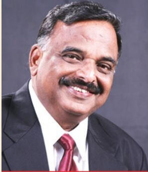
Founder & Chairman

“Arise awake and stop not till the goal is achieved”