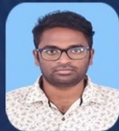
Ramani A IV - Food Tech.