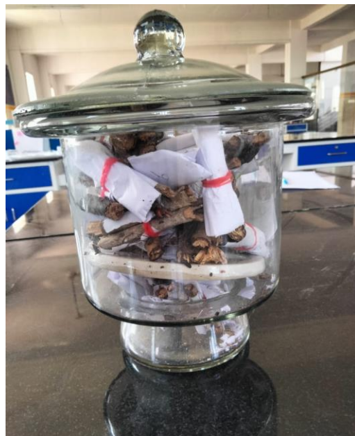
Desiccator with cover (150 mm)