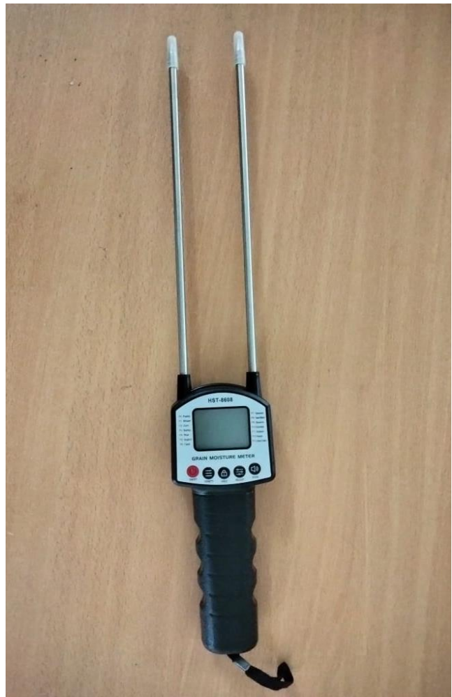
Grain Moisture meter