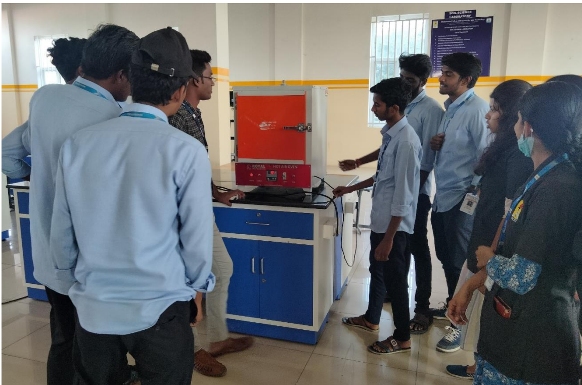
Hot Air oven