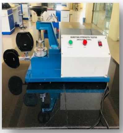
VACUUM PACKAGING BURSTING STRENGTH TESTER