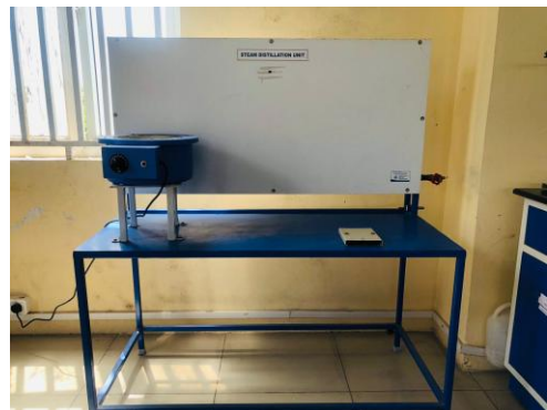
STEAM DISTILLATION UNIT