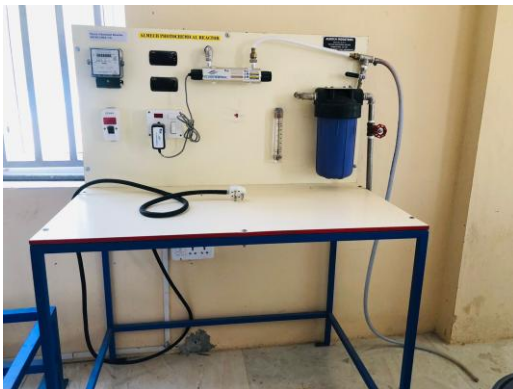
PHOTO CHEMICAL REACTOR