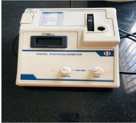
DIGITAL PHOTO COLORIMETER