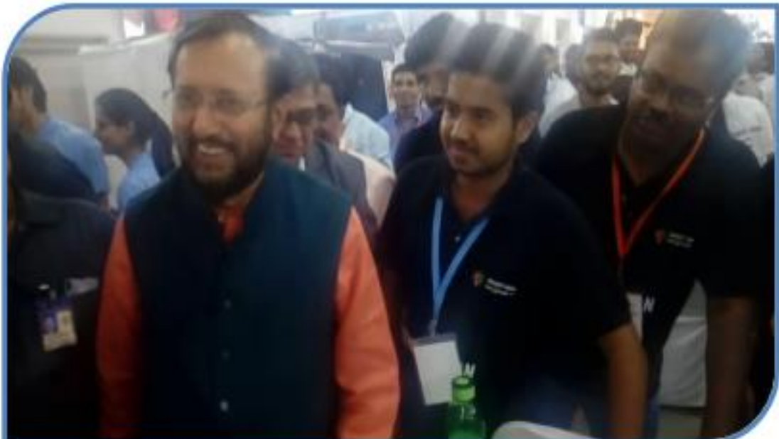
Our EEE Students, Faculty team members along with Honorable Minister @ Hackathon