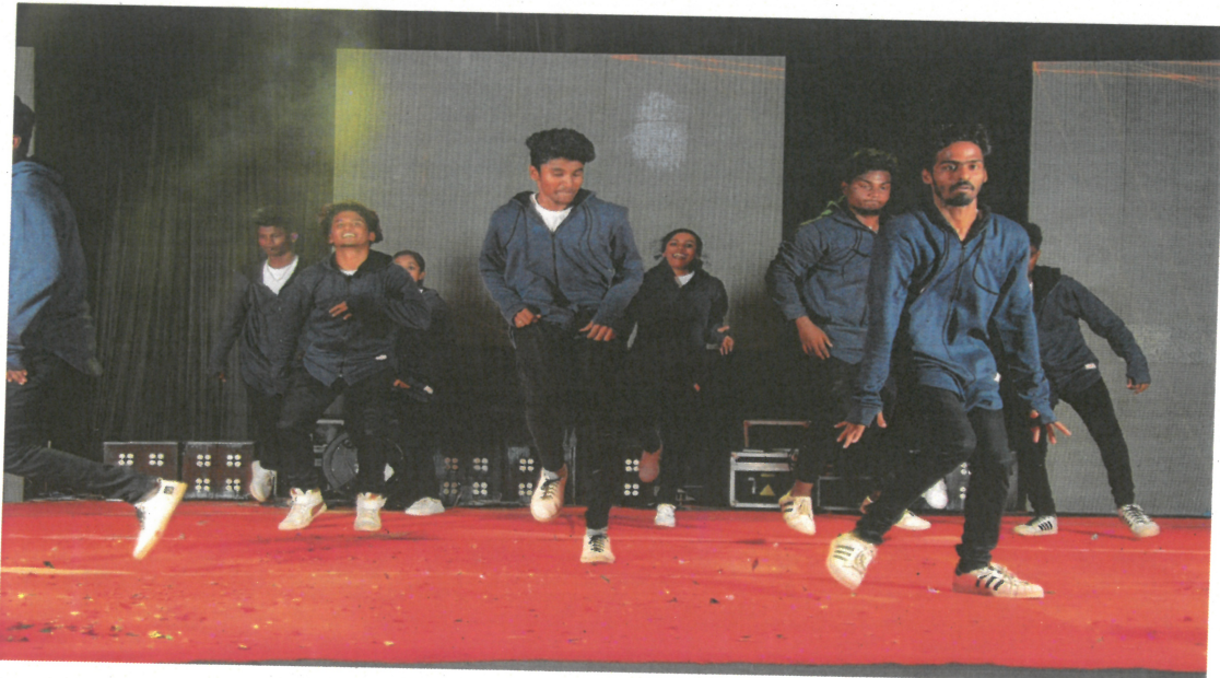
Photograph taken during a group dance