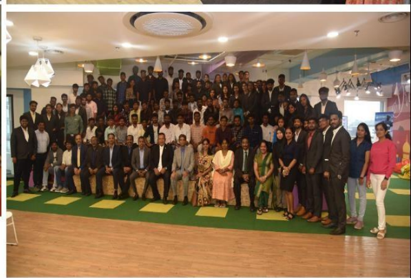
Mr.B.N.Reddy High Commissioner of India to Malaysia