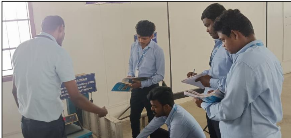
Wagner Beam setup