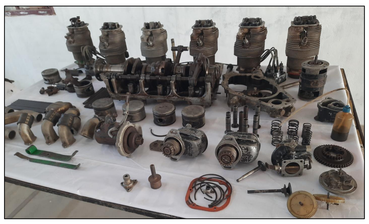
Aircraft piston engine assembly