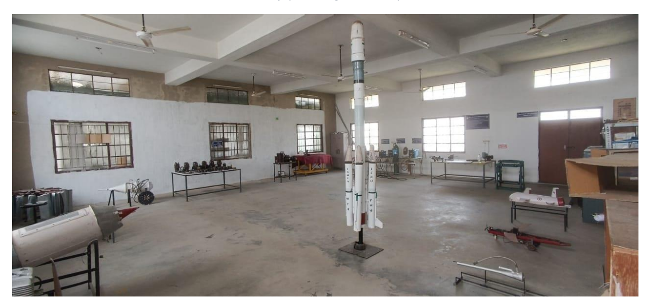
Aeroengine and airframe laboratory